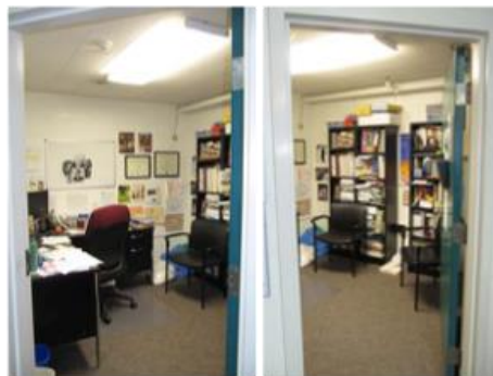
EXISTING STAFF OFFICE