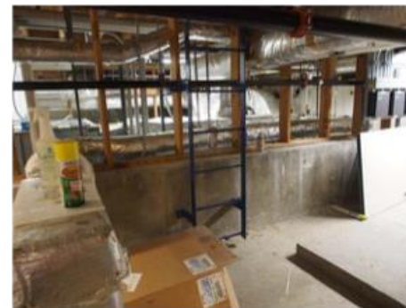
EXISTING MECHANICAL LOFT