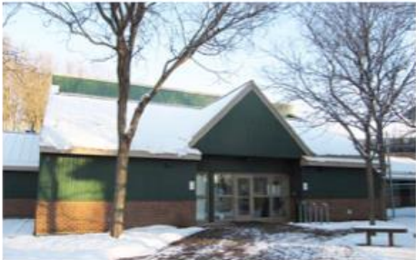
EXISTING BUILDING ENTRY