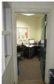
EXISTING STAFF OFFICE