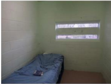
EXISTING RESIDENT SLEEPING ROOM