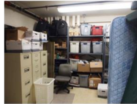
EXISTING STORAGE ROOM