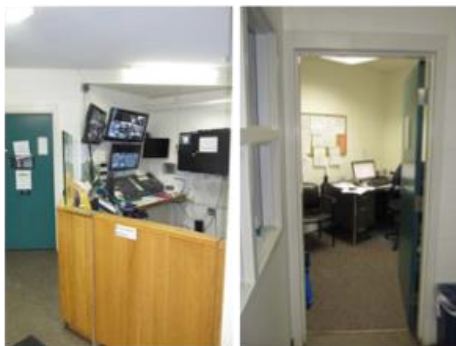
EXISTING CONTROL ROOM