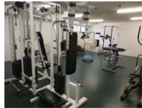
EXISTING FITNESS ROOM