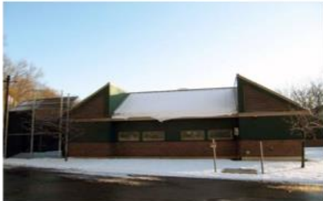
EXISTING BUILDING WEST WING